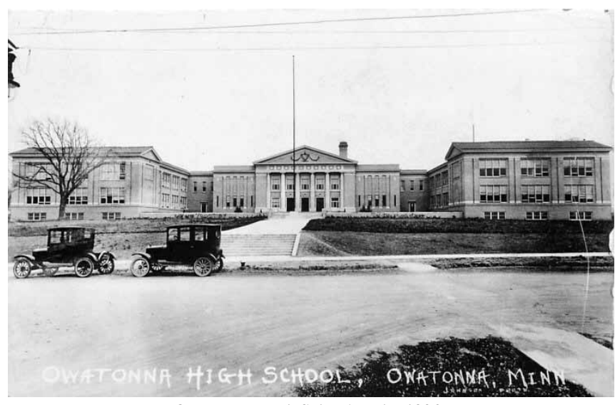
Owatonna High School in the 1920s