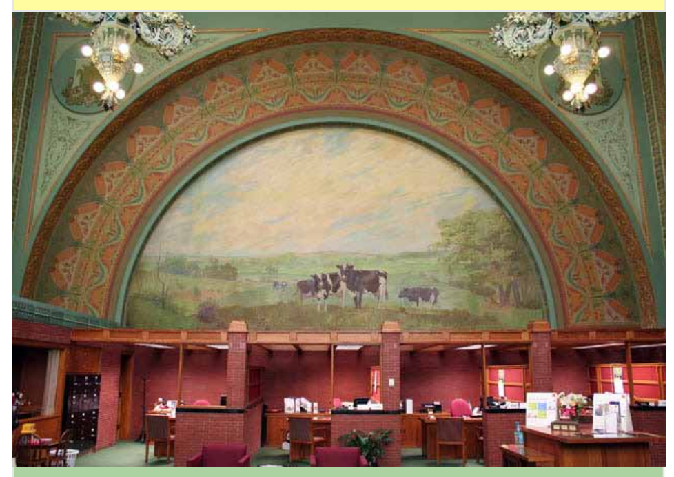
The National Farmers' Bank of Owatonna, Minnesota is a bank building designed by Louis Sullivan with decorative elements by George Elmslie. It was built in 1908, and was the first of Sullivan's "jewel boxes". The lobby mural salutes agriculture and the dairy industry.

FRIGIDAIRE HOME APPLIANCES COMMERCIAL REFRIGERATION AIR CONDITIONING